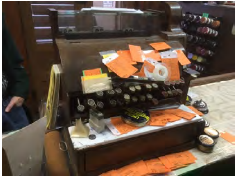
Old Cash Register